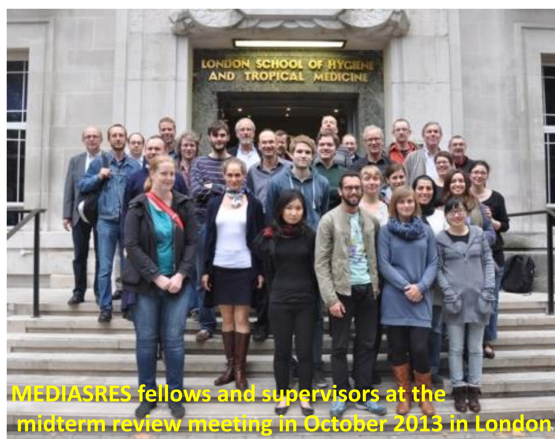
MEDIASRES fellows and supervisors at the midterm review meeting in October 2013 in London